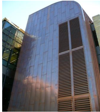
St. Olaf College, Northfield MN Architects - Holabird and Root Installed 2008