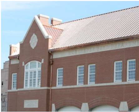
Worcester Fire Station, Worcester MA Architect - Maguire Group Installed 2007