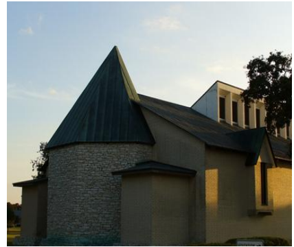
Giddings School, Giddings TX Architect - Edward Mattingly Associates Installed 1972