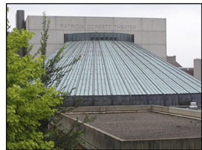
Patricia Corbett Theater, University of Cincinnati, CopperPlus roof installed in 1971