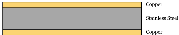
Cross section of CopperPlus

CopperPlus is a metallurgically bonded metallic composite strip produced by roll bonding. The roll-bonding process is based on solid-state welding technology, requiring no adhesive or brazing alloys to achieve a clean, permanent, bond. The clad material has excellent bond integrity due to the nature of the metallurgical bond that develops between the copper and stainless steel layers.